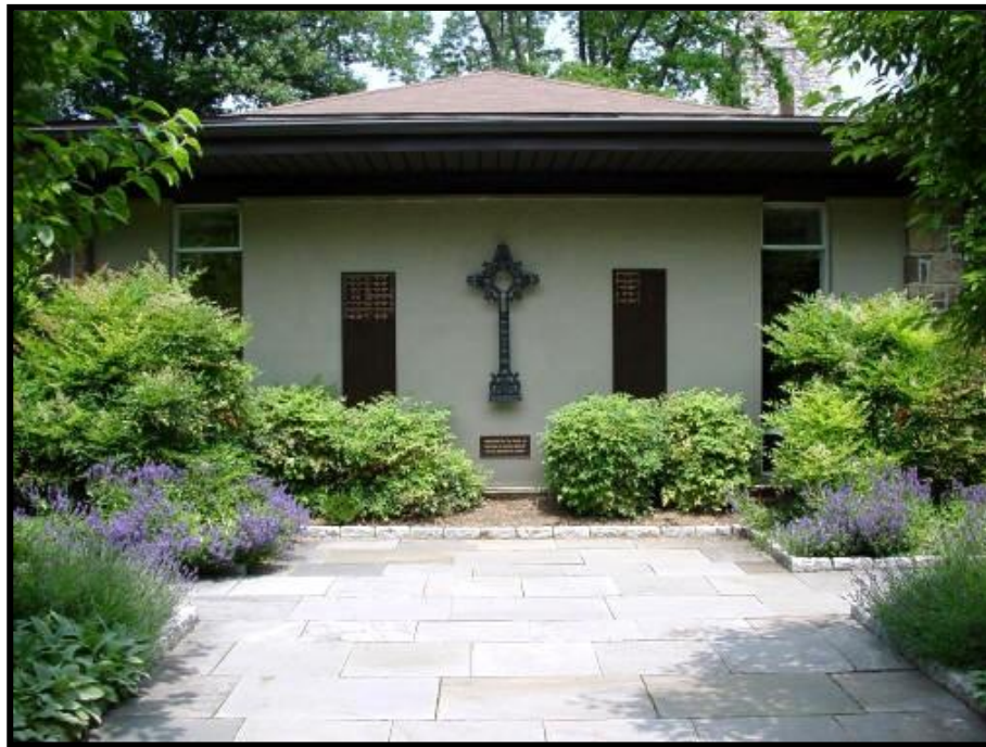
Garden of Remembrance Christ Church Ithan

Donations may be made to the Pennsylvania Horticultural Society, 100 N. 20th Street, 5th Floor, Philadelphia, PA 19103 or Christ Church Ithan, 536 Conestoga Road, Villanova, PA 19085.